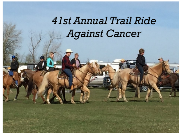
41st Annual Trail Ride Against Cancer